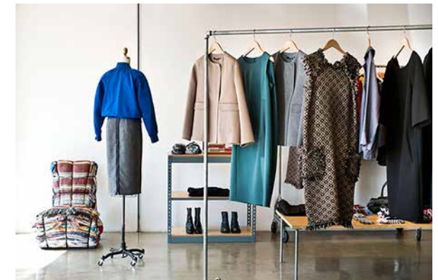
Noodle Stories Los Angeles, CA