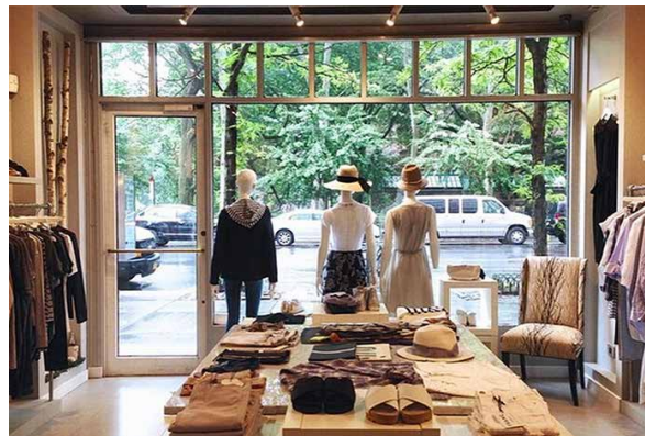
bocnyc New York, NY