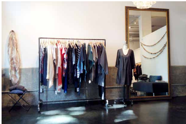
Juniper Seattle, WA

Avant Toi, MM6, Pas de Calais, R13, Rachel Comey, Raleigh Denim, Rick Owens Lilies, Two & Yoshi Kondo.