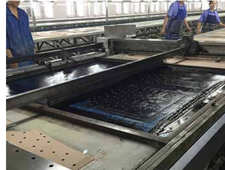
Silk Screen Printing